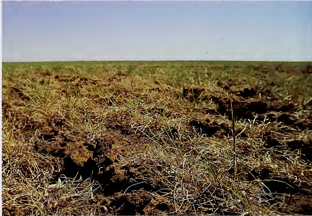
This dryland wheat field in New Mexico suffered significant damage from Russian wheat aphid.

From 1987 through the 1988–89 growing season, crop losses attributable to Russian wheat aphid infestations in the Western United States totaled